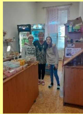
This is our buffet where you can buy different kinds of food, snacks and drinks.