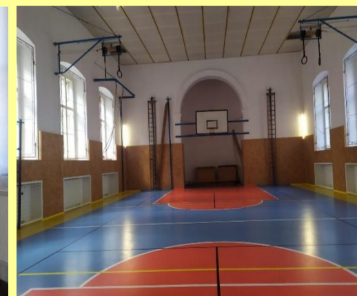
This is our gym where we have a lot of gadgets.