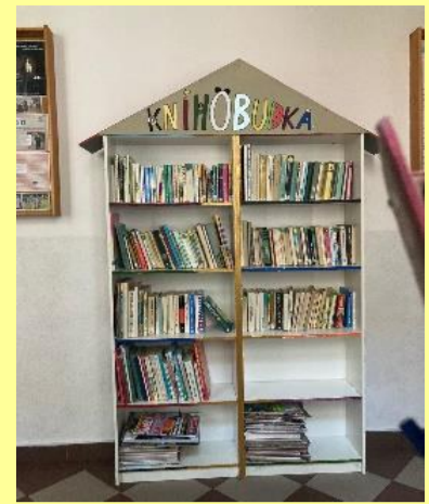
This is our book booth, where we can borrow books.