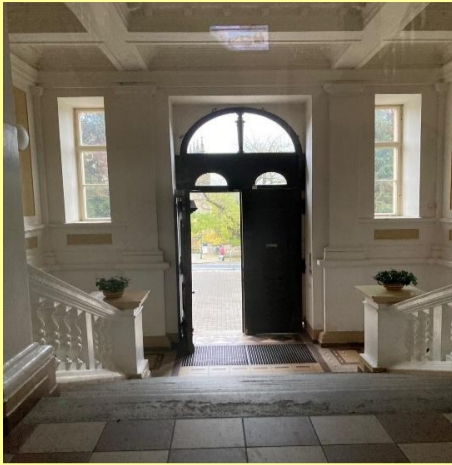
There is our school entrance. This is where we enter our school.