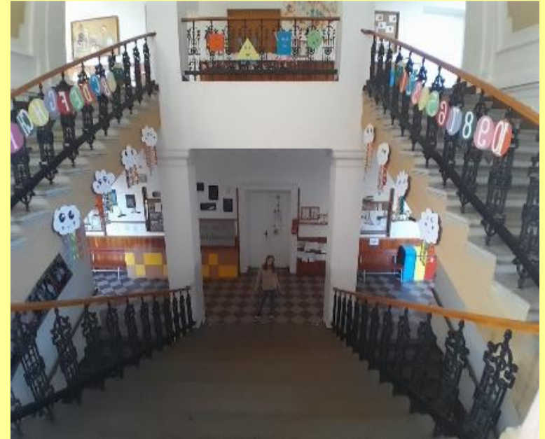
This is one of our staircases where we have decoration from kids in our school.