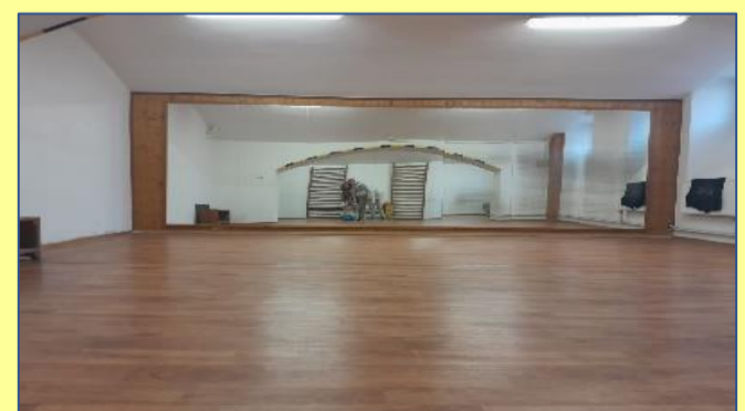
This is our mirror hall where only teachers can go.