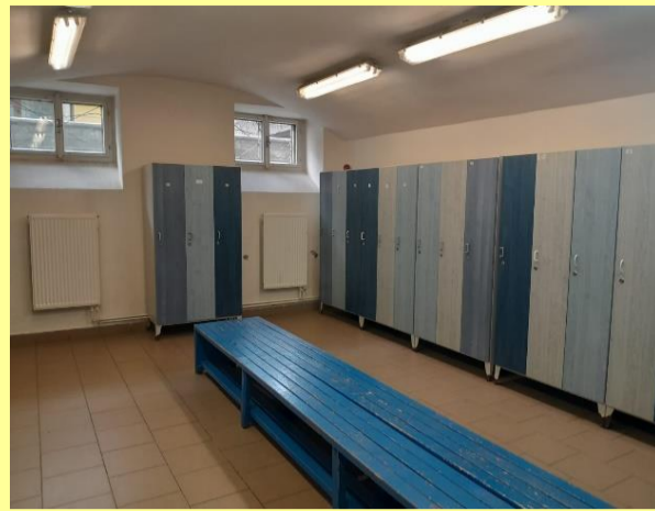
This one of our locker rooms, we put our jackets and shoes.