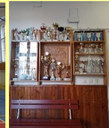
This is one of many places where we keep our trophies.