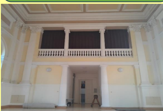
This is our assembly hall where we can stage our drama plays and exercise.