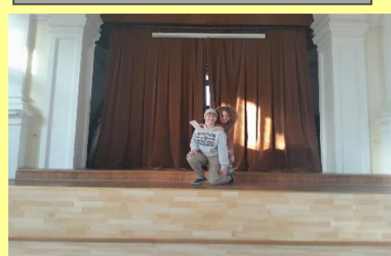
This is the stage in our assembly hall where we play our drama plays.