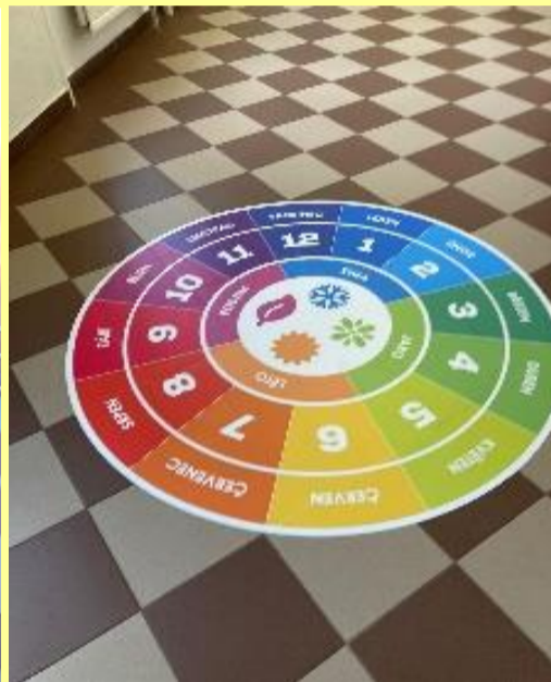
This is some decoration on the floor in second floor.