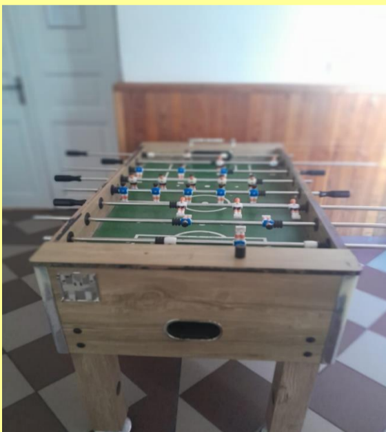
There we spent our free time in between our classes.