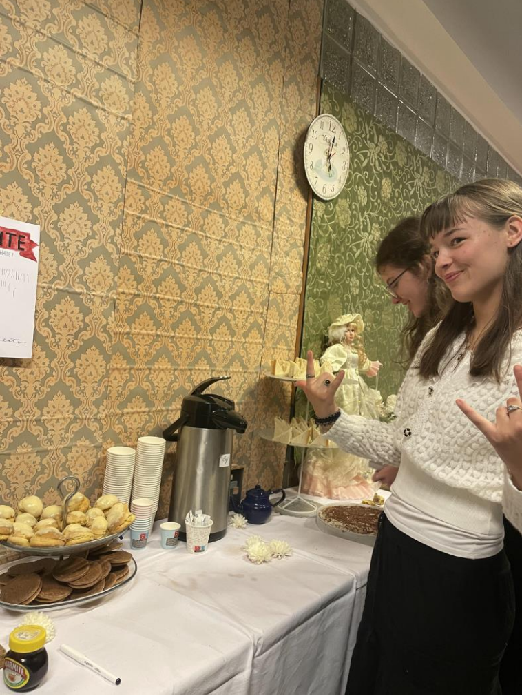
There is Via`s sister and she is doing a pose. There are pancakes and it is traditional breakfast in England.