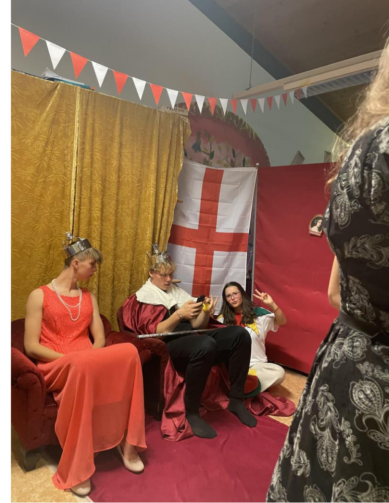
There is the King with the Queen. Behind them THERE is a flag of England.