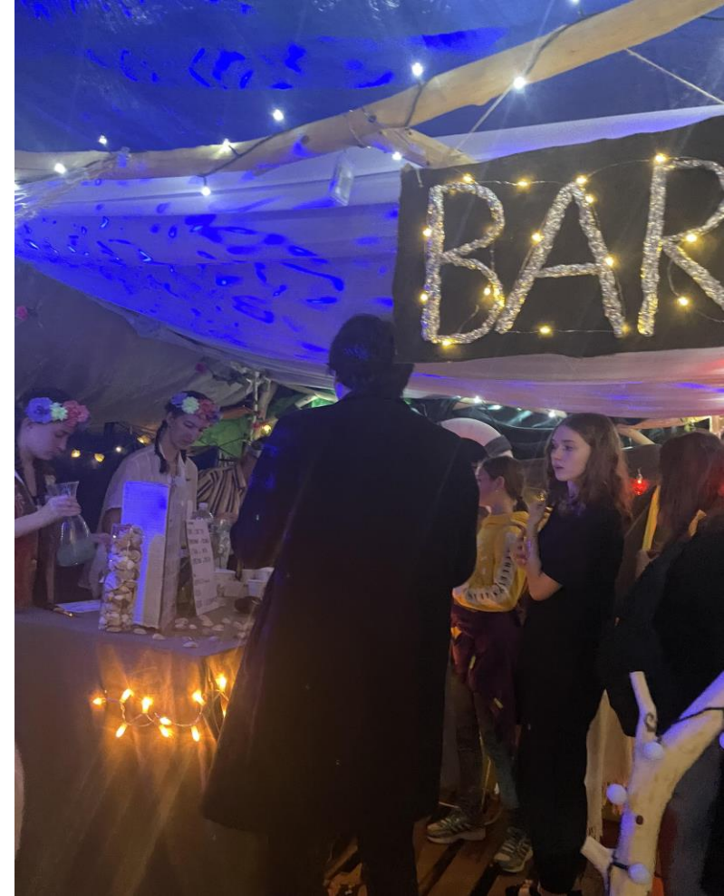
There is a bar with snacks and drinks