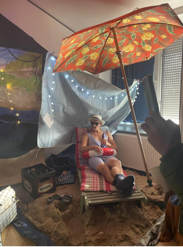
In the picture there is a man that is sunbathing. It is on the beach. He likes beer.